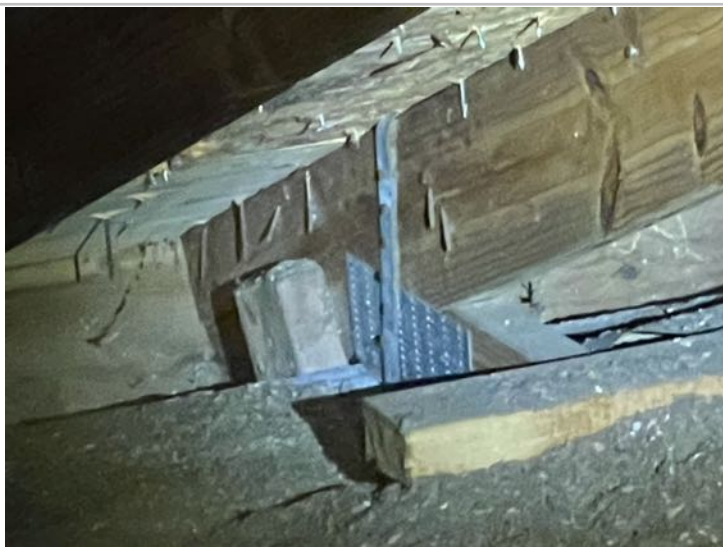
Strap- Anchor Side