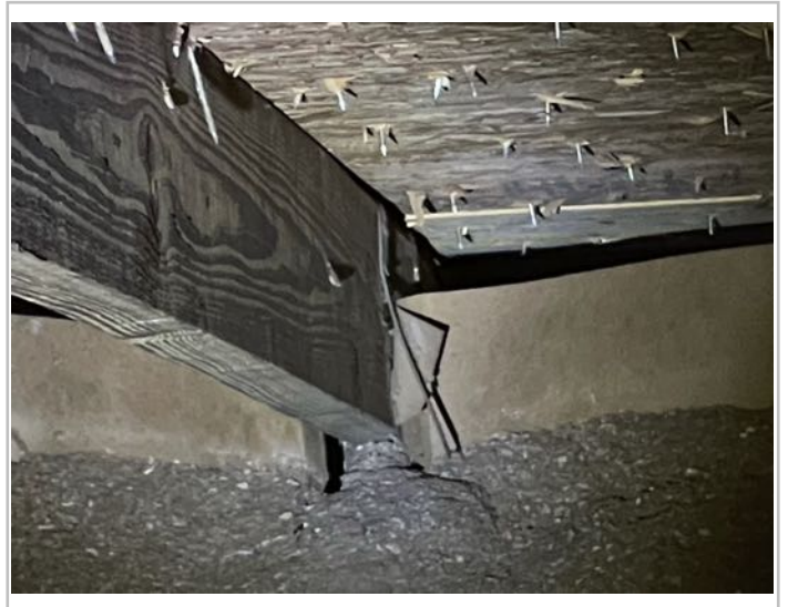
Strap- Opposing Side